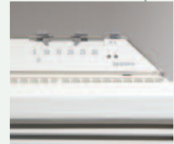
RDC 700 Thermostat