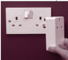
RCE 700 Receiver