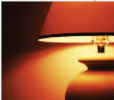
Table Lights etc