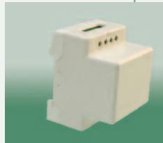
RSX 700 Receiver