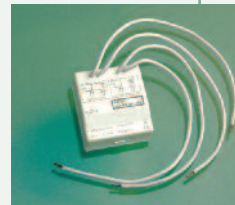
RS 700 Receiver